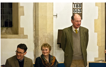
Friends of Long Compton Church fundraising activities see page 4

Donations of over £10,000 for renovation work (Page 4)