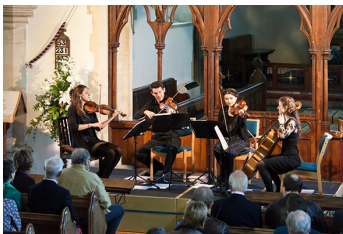
Leos Strings Quartet raising the roof see page 3