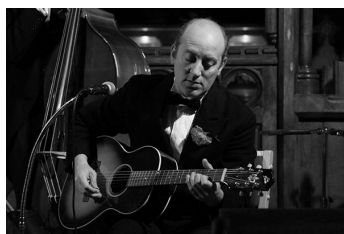
Hot Fingers see page 3

Geoff Dewhurst reports on this evening to remember (page 3)