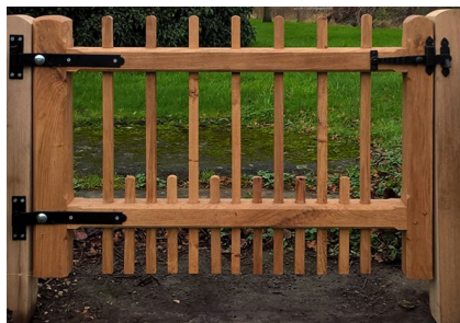
New gates courtesy of a kind private donation