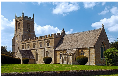
Chancel ceiling repairs—high level works

Chancel ceiling repairs: Over the last few years a small amount of plaster has fallen from the chancel roof, we think this is due to high winds vibrating the roof tiles and working free the old lime plaster. This will need to be replaced like for like which needs the use of a high level work platform, the hire of which is where the majority of the expense will occur. Consequently, we are looking to combine other high level jobs such as the electrical testing and replacing the smoke detector batteries, high level cleaning etc, to make best use of the equipment whilst on site.