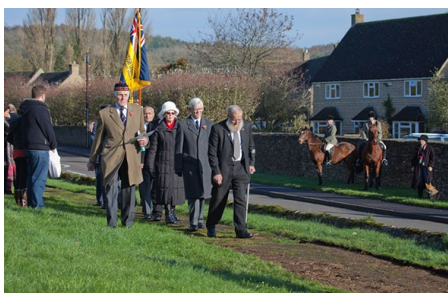
The path needs replacing

Electrics: We have also experience a regular tripping of the electrics in the church. It was thought that this was due to either a faulty appliance in the kitchen or the alarm system, but we have since had it all tested and have not discovered any faults. However, during this testing it was discovered that some of the electrical wiring is old and potentially unreliable, and is unlikely to pass the five-yearly electrical circuit inspection and test. We are awaiting estimates for this work but it is likely to be in the region of £5000.